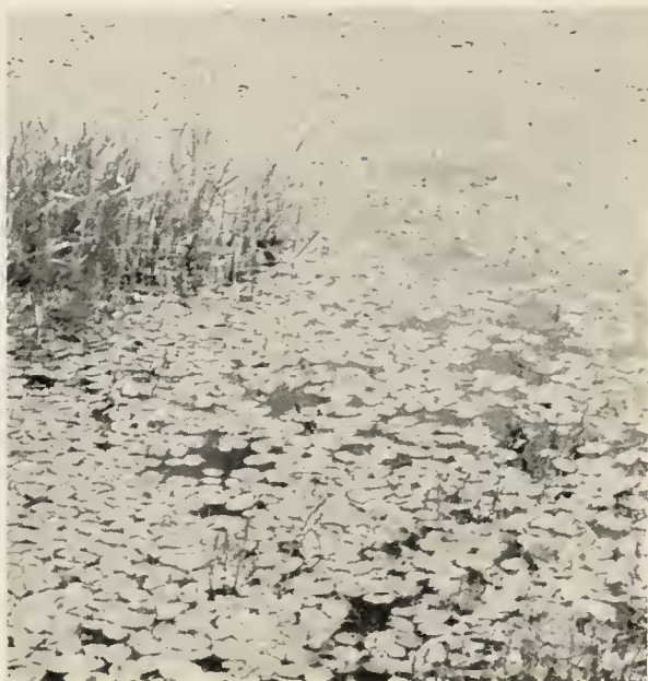
FIG. 2. Pond of watershield in "Paille Fine" marsh.

In the spring, the first rice fields occupied by Fulvous Tree Ducks are in the area bordering the coastal marshes and extending inland about 20 miles. As these lower rice fields are being planted, flocks of the birds loaf and feed in the native marsh throughout the day and fly into the fields to continue their feeding at night. Fish and Wildlife Service personnel estimated that in May, 1945, 5000 tree ducks were operating between the Lacassine Refuge marsh and adjacent newly-sown rice fields.